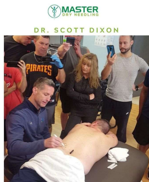
TEACHING ABOUT QL AND ILLIOSTALIS LUMBORUM